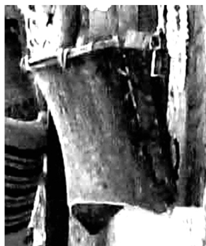
Photo of Poplar bark pouch.